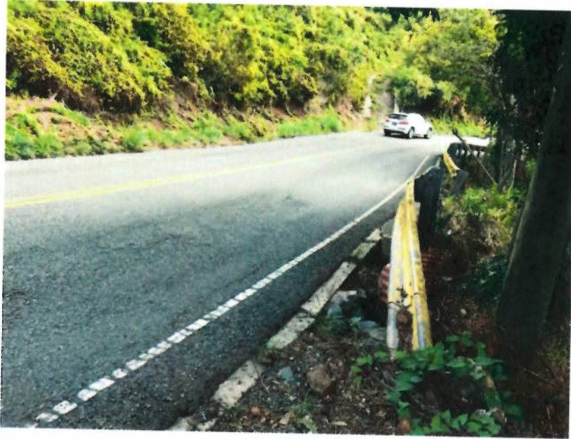
STT Site 7 – Rt 405/332