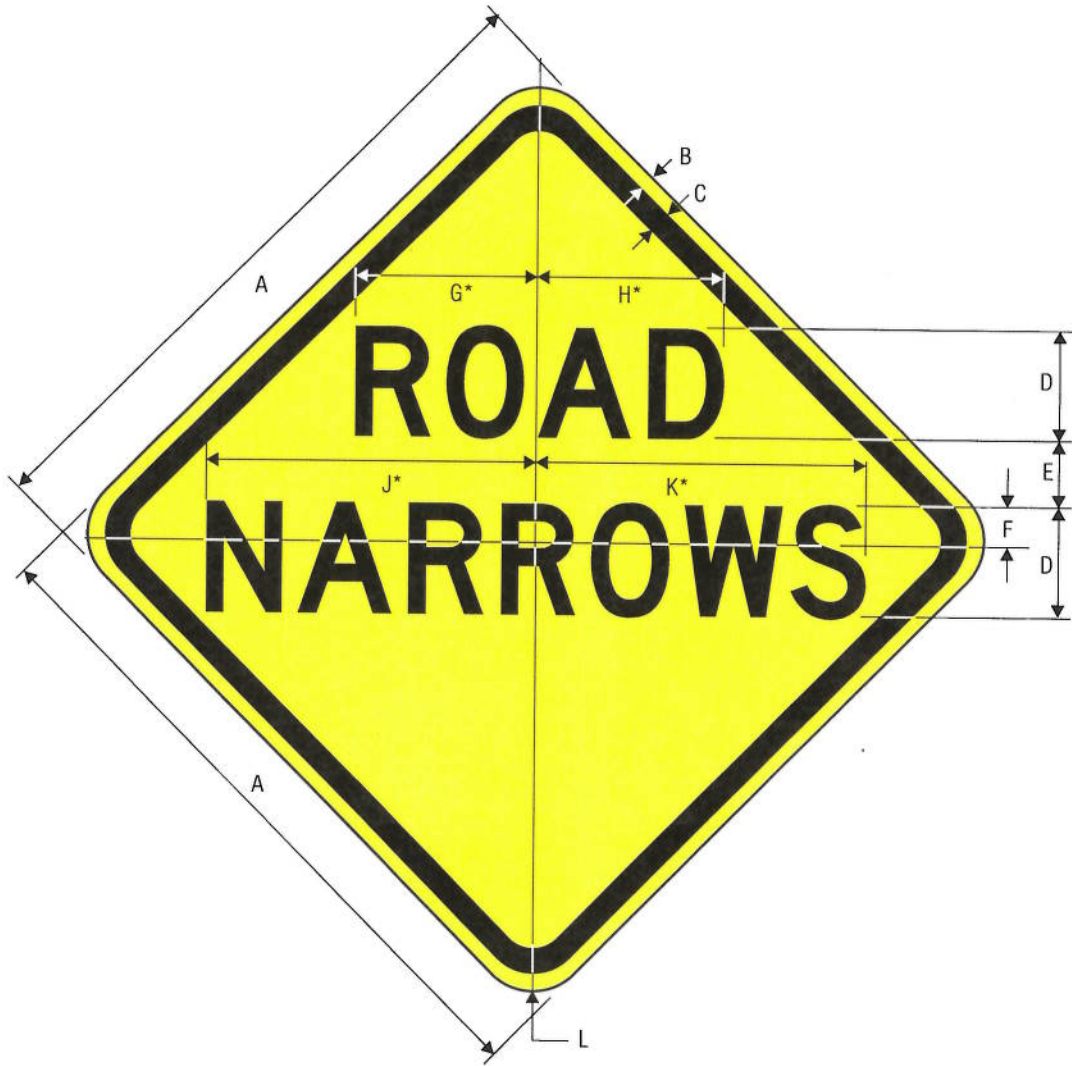
W5-1 ROAD NARROWS