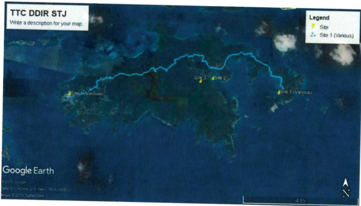
STJ Site 1 – Rt 10