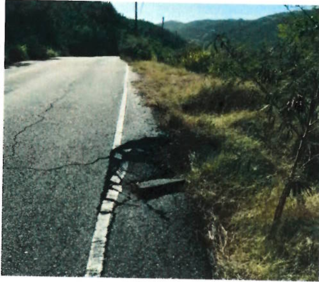
STT Site 5 – Rt 38