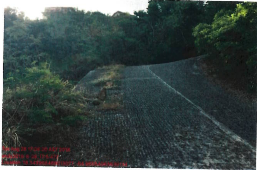
STT Site 3 – Rt 333