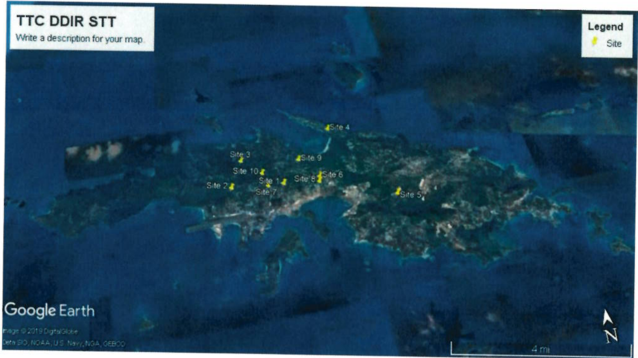
STT Site 1 - Rt 332