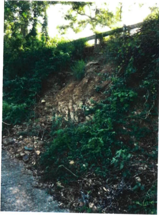
STT Site 10 – Rt 33